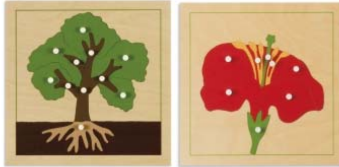
Puzzles of parts of a tree (left) and parts of a flower (right)

Parts of a tree, flower, leaf, and root system are the four staple botany puzzles supplied by most Primary classes. These are excellent resources and allow children to continue working with their three-fingered grip and hand-eye coordination as they mix and match puzzle pieces as they learn new vocabulary terms and concepts.